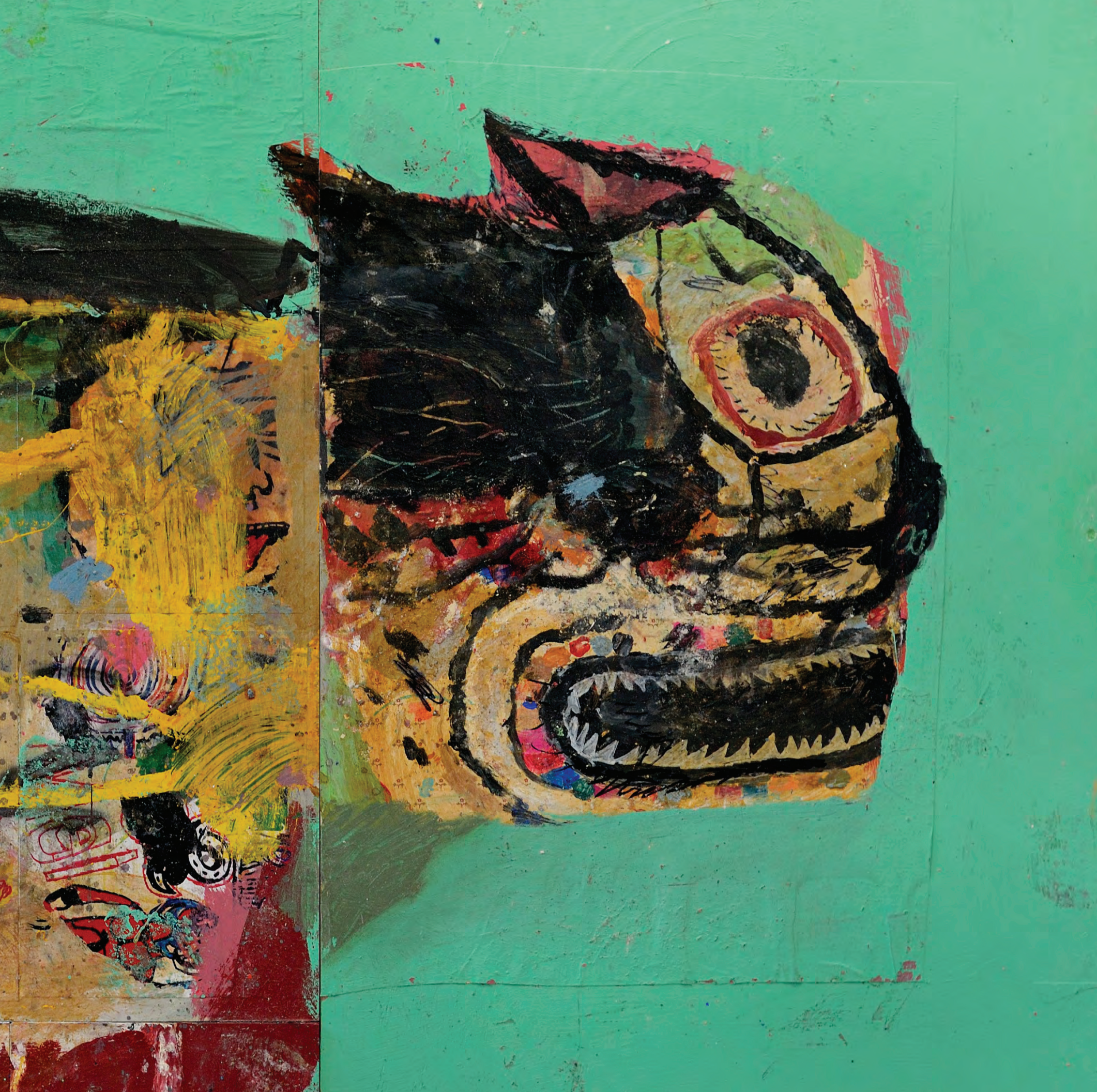
"Felix" - 48" x 48", 2014

"It's just people coming together, and it's just born really of that regional culture. And that's what I really love. I see the beauty and the art in that, and I want to bring that to the shows."