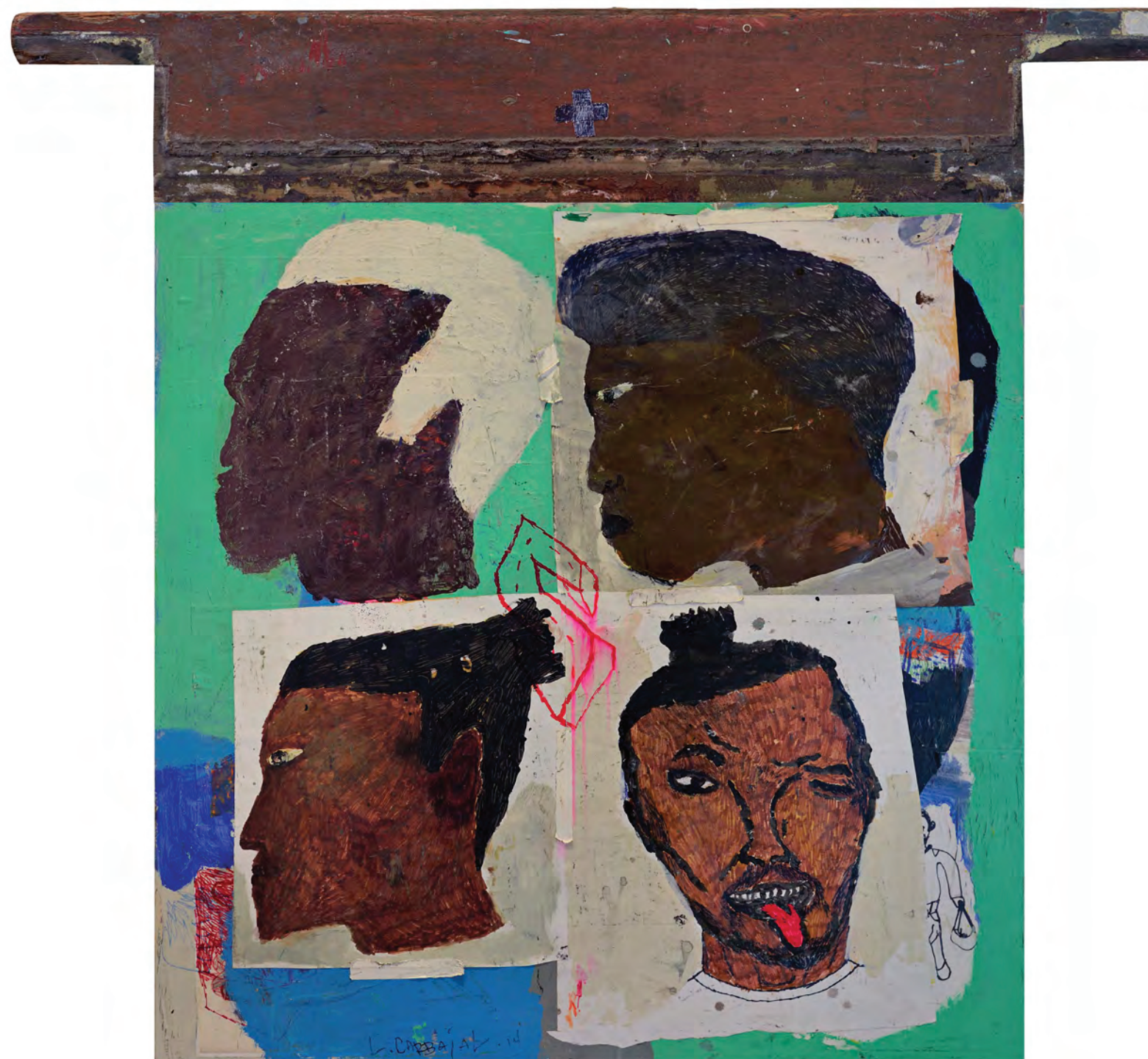
"Self Portrait as Narcissist" - 32" x 38" / 2014

He went on to passionately speak to their inclusion in the exhibition and the deeper symbolic representation.